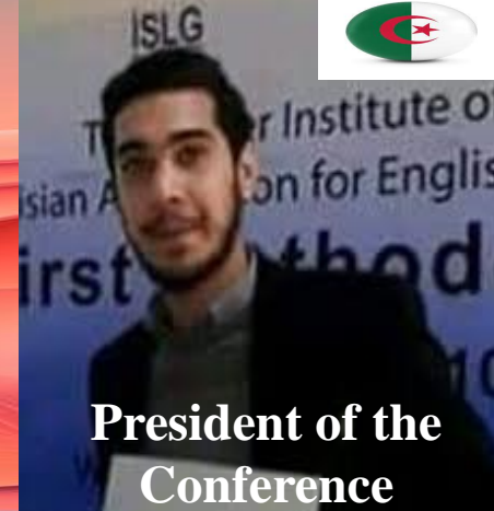
President of the Conference