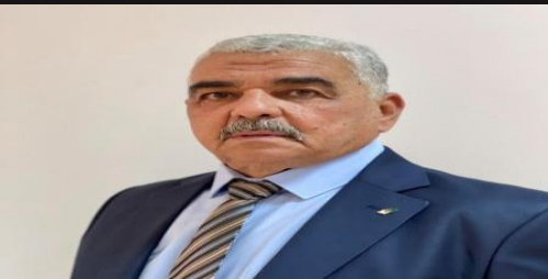
Rector of the University