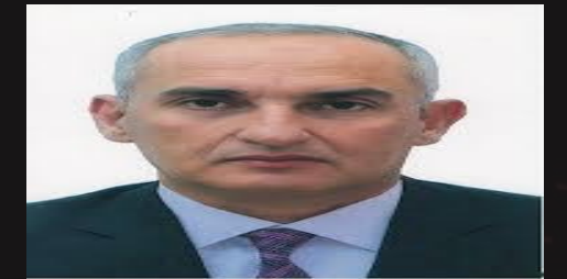
Dean of the Faculty